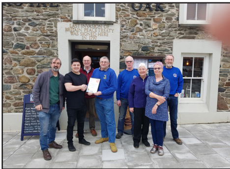
Pembrokeshire CAMRA presenting the Royal Oak with the Pub of the Year Award for 2020

Between them, the twin towns of Fishguard and Goodwick have a number of really interesting pubs offering some fine ales and with the added advantage that you can visit them while enjoying a picturesque walk of not much more than a mile in total. You can also do the whole thing using public transport, arriving by train at the Goodwick end or by bus if you prefer to start at Fishguard.