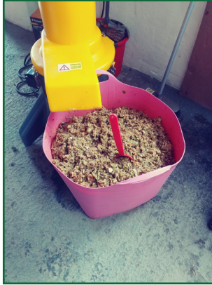
Milling apples to make pomace (scratting)

Do seek out some of these real ciders, you may well get a nice surprise. You never know what you have been missing!