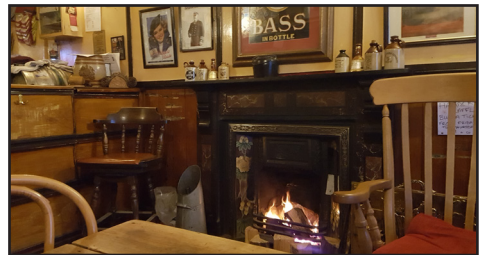
The cosy interior of the Fishguard Arms

After making a mental note to return to the Royal Oak on Tuesday evening for a session of "Folk at the Oak" or, better still, on the late May Bank Holiday weekend for four whole days of the annual Folk Festival, you only need to walk another 100 yards or so along Main Street to visit two more pubs, each with its own distinctive character, the Fishguard Arms and the Globe . On your way there, you will pass by St Mary's church on your left. Directly opposite is what used to be St Mary's Church Hall but today houses a delightful bistro/music venue called simply " Ffwrn ", the Welsh word for "oven". If the doors are open (generally only from Easter through to autumn), be sure to drop in, and you will instantly discover the reason for the rather unusual name of this establishment, namely a rather impressive clay pizza oven. No doubt you will also find a barrel of ale behind the bar being served on gravity, often from the excellent Gwaun Valley brewery.