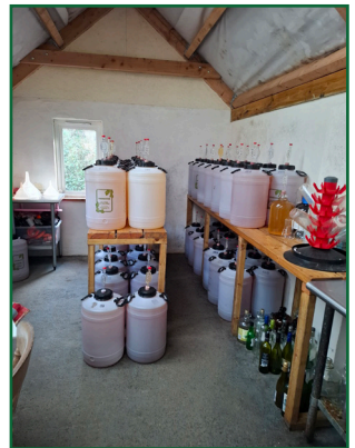
Fermenting cider - Yeast turns sugar to alcohol, CO2 is released, airlock keeps oxygen out