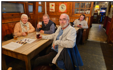
Our party enjoy a pint in the Ship and Mitre

CAMRA and SIBA were natural allies, with the first campaigning to support the small independent breweries comprising the second. He also gave an inspiring portrayal of CAMRA's Revitalisation Project, which aims to reach out to younger ale lovers and drinkers generally.