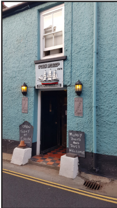
The Ship in the Lower Town

If you're feeling peckish by now, you will also find some tasty snacks at Ffwrn on most days. The Fishguard Arms and The Globe are only a couple of doors apart, and both date from the late 18 th Century. Inside, the former looks like it's hardly changed in all that time, and is full of character, while the Globe's interior is a mixture of modern and ancient (e.g. the huge "simne fawr" fireplace). The landlady/-lord will tell you all about its interesting history!