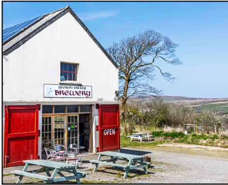
Gwaun Valley Brewery, high in the Preseli Hills