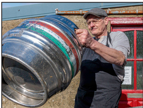
The Brewer at Work

Because of lockdown, the first competition he entered entailed sending bottles of his ales off to be judged. The result was a gold prize for his white IPA (Cwrw Gwyn) and a bronze for his Pembrokeshire Best Bitter. The following year, he entered cask ales and his Traditional Porter, a style of ale he's brewed more than any other, won a silver in its class (dark session beers under 4.2% ABV). In 2024, that same porter won a gold in its class and, even more impressively, a silver in the overall cask category.