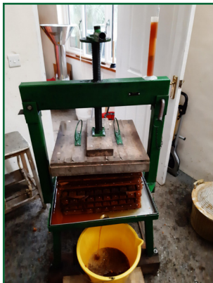
Pressing pomace to produce juice