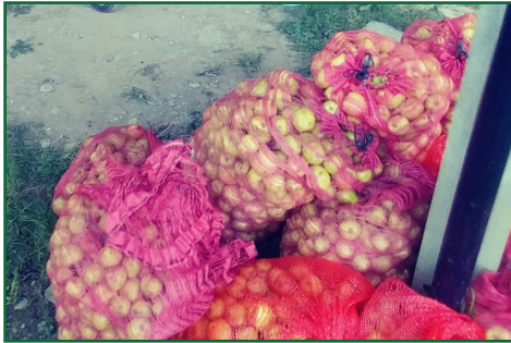
Bags of cider apples awaiting processing

Cider making and drinking has a long and proud history in the UK, and still today we are the largest producer and consumer of cider in the world. Sadly, most of the cider that is sold and drunk today is a pale shadow of the real stuff. Luckily there has been a resurgence of interest in producing proper cider in the past few years and the National Association of Cider Makers reckons there are at least 480 cider makers in the UK.