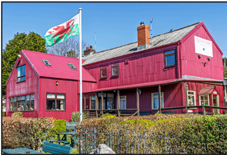
The Tafarn Sinc

Because here in Pembrokeshire, as elsewhere around the country, local communities are fighting back, taking action to save their local pub by buying it out and running it themselves, often successfully. Inspiring by their example other communities to save their locals too.