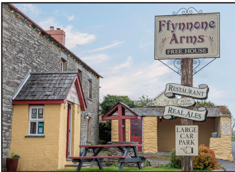
Pembrokeshire Pub of the Year - The Ffynnone Arms

Additionally, to give our best pubs a fair chance, Pembrokeshire, like many other Branches, has decided that the same establishment cannot win or be runner up two years in a row, so every pub has a fair chance of winning our top awards.