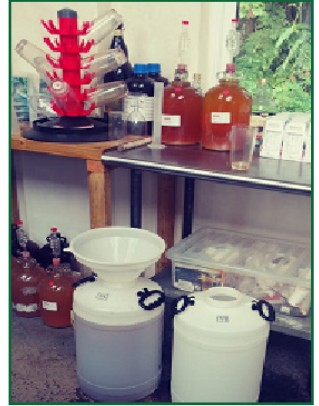
Collecting apple juice