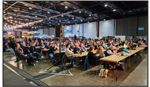
Waiting to hear the winners of this year's SIBA awards