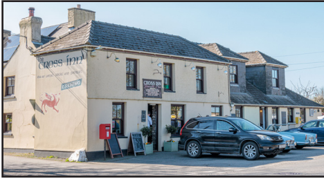
Y Cross, Hayscastle Coss

again, the local community had other ideas. On 15 th August 2022 the community met in the local Chapel Hall.