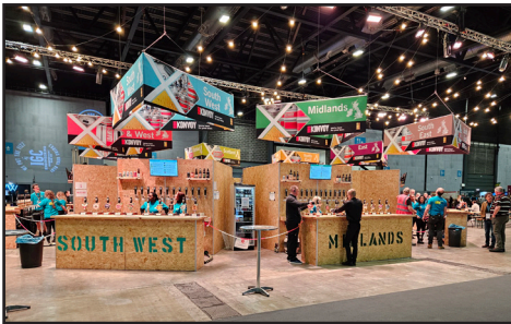
The Real ale and craft beer bar at BeerX