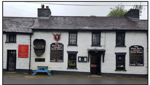
The White Hart St Dogmael's

In 2017 they retired, and the pub faced possible closure after over a hundred years. However, the local community rallied round. At a public meeting in Maenclochog Hall on July 12 th , 2017, organised by West Wales Community Support group PLANED and local community newspaper Clebran , by a unanimous vote the locals voted to fight to save their local. £7000 was raised that night and subsequently sales of shares in Cymdeithas Tafarn Sinc, the community benefit society set up to save the pub, raised £400,000. In November 2017 the locals bought their local and it was saved. A traditional Welsh local, with sawdust on the floor and fine local ales behind the bar (it's deservedly in the CAMRA Good Beer Guide ), to say nothing of solid Welsh country food on the menu, and friendly, often Welsh-speaking, staff and locals it is well worth a visit. There is a caravan site close to the pub if you don't want to drive home! You can still buy shares in the pub if you like too!