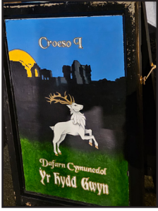
The White Hart's pub sign

But again the community rose up and took action to save their local. It took two years of fundraising and campaigning to raise the funds to be able to purchase their village pub. Over 550 people bought shares in the community buyout vehicle, mostly locals, including local CAMRA members, but some from other